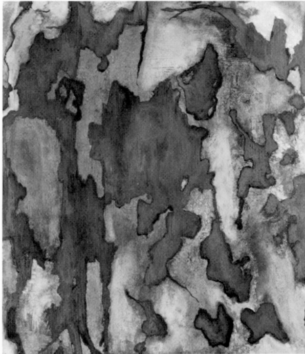
Lake District #1 1986 oil and dry pigment on masonite 24 x 21 in./61 x 53.3 cm. Collection of the artist