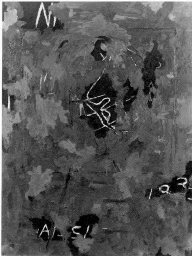
Hidden Agenda 1985 oil on canvas and wood 42 x 32 in./106.7 x 81.3 cm.